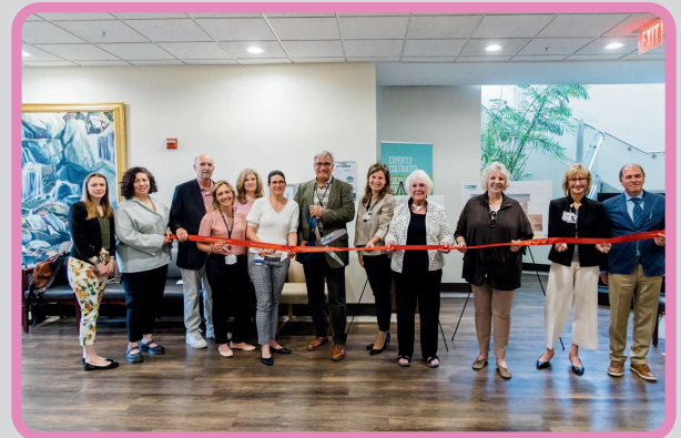
Community leaders along with staff and board members of CMH and the CMH Foundation.